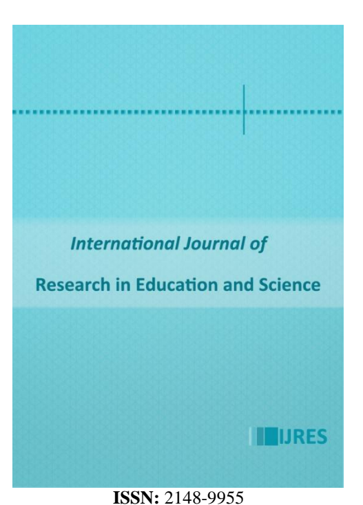
International Journal of Research in Education and Science (IJRES)